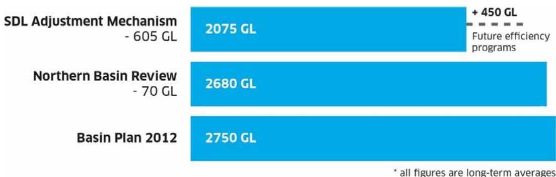
Figure 3: Water recovery changes through the Northern Basin Review and the sustainable diversion limit adjustment mechanism

In 2012, a water recovery target of 2,750 gigalitres was set by the Basin Plan. Through recent amendments to the Basin Plan, the water recovery target has been changed. Environmental outcomes are being sought, but with less water, through projects known collectively as the sustainable diversion limit adjustment mechanism. Therefore, 605 gigalitres of water can now remain in the system for other users, provided that these projects deliver the benefits currently estimated. There is also bipartisan support to change the water recovery target in the northern Basin following the Northern Basin Review. The water recovery target is expected to change by 70 gigalitres in the coming months, alongside the delivery of a number of environmental works and measures collectively known as the Northern Basin Toolkit.