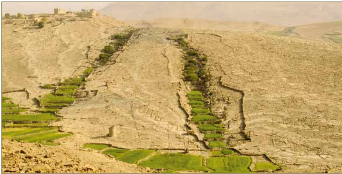
Figure 1. Spate system in Yemen

crude, it ideally suits the need in a spate system to share a very uncertain quantity on the basis of simple rules and quick communication. The outcome (see Figure 1) is an apparently rather uniform distribution of water among users.